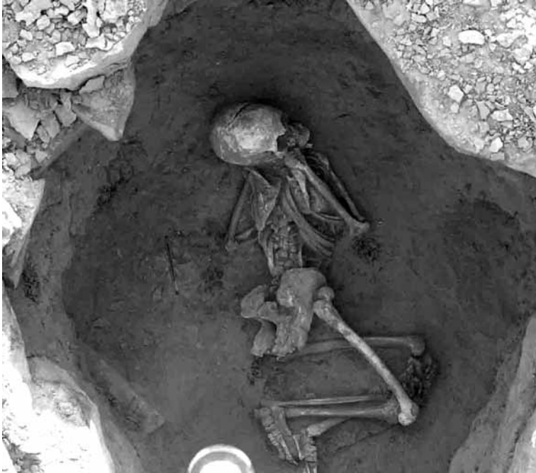
Fig. 2a: The upper 1st millennium BC (Nabatean) adult female burial