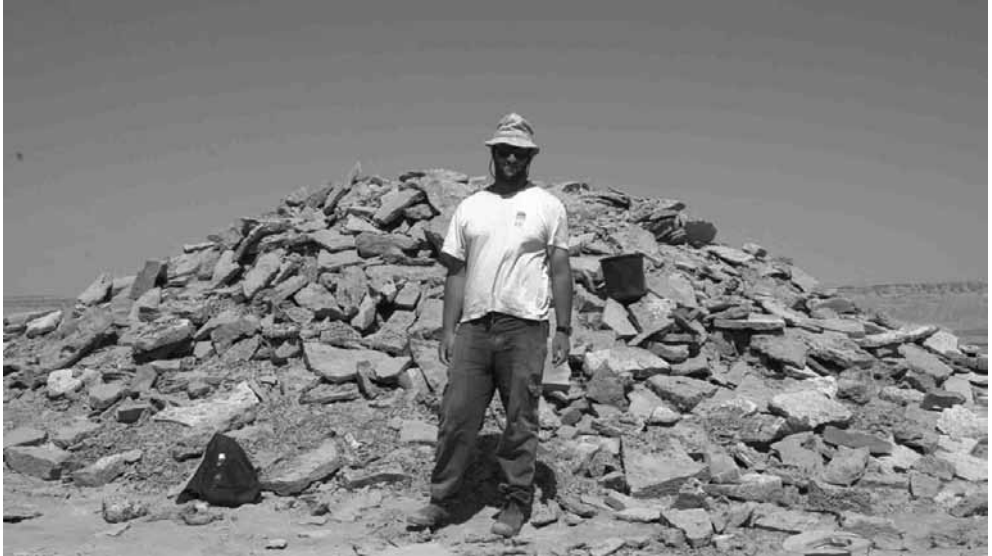
Fig. 1: Outer view of Tumulus T29

an elaborate mortuary cult associated with the early phase of the Timnian Culture, the early desert pastoral society in the region (Rosen 2010: 204-206). This report describes an equid metacarpal, discovered in association with human remains in Tumulus 29. It provides new information on mortuary practices in the southern Levantine desert region at this time.