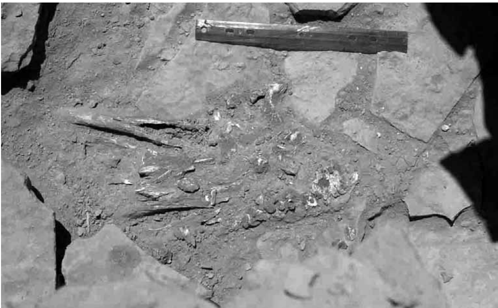
Fig. 2b: The lower Late Neolithic unsexed adult burial. Note marked difference in preservation between the two burials