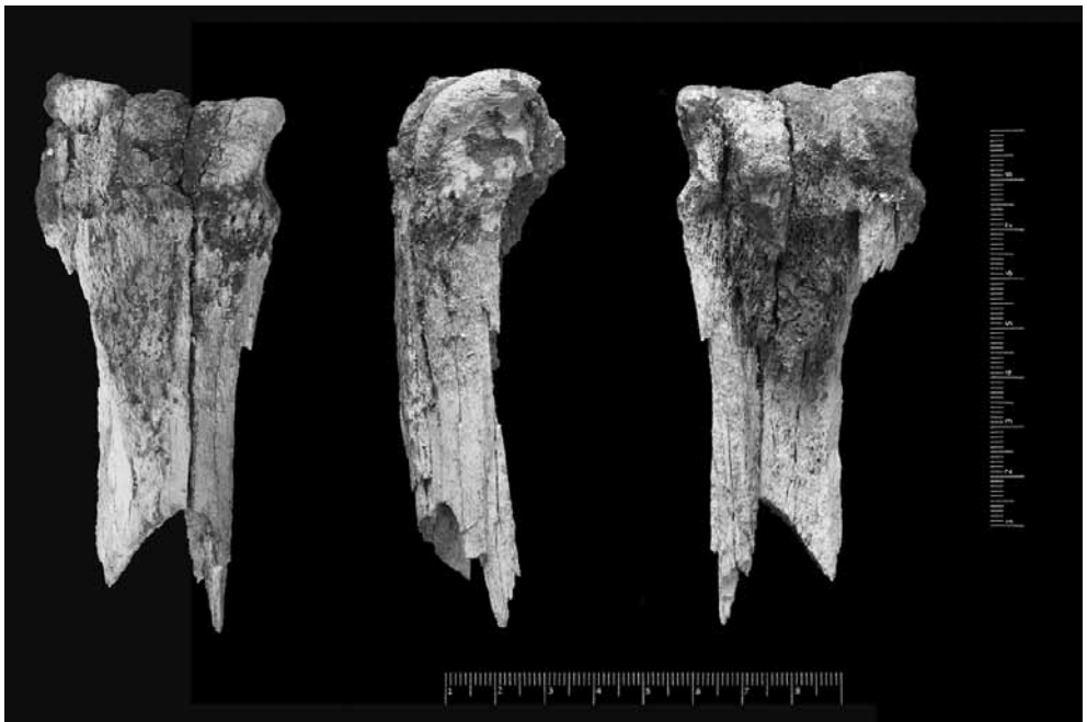
Fig. 3: Distal equid metacarpal from Saharonim T29. Photographs: (left) plantar aspect; (centre) dorsal (cranial) aspect; (right) volar (palmar) aspect

The Saharonim bone represents a fused, distal metacarpus with a small portion of the shaft preserved (Fig. 3). Given that the proximal end of the shaft has an old green-fracture break, the bone may have been complete when introduced into the tumulus and disintegrated there. The distal epiphysis is fused, such that the animal was older than 1-1.5 years (Silver 1969). The surviving fragment is poorly preserved; the bone is fissured, very friable and its surface